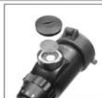
(Location of the rheostat may vary. See Illustration II on p.1.)

Turn the illumination adjustment control to adjust the intensity of illumination. The battery (included with the scope) is a coin style lithium battery. When replacing battery, insert it with the positive (+) side uppermost in the battery compartment.